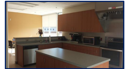
Break Room with Balcony